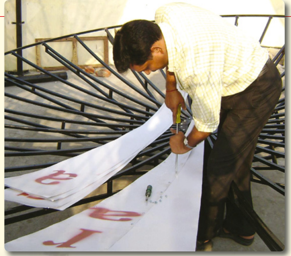
All individual segments are screwed onto the dish construction.